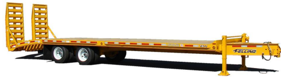
• Shown with optional air ramps and paint.